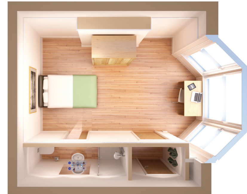
Room 1 & 4