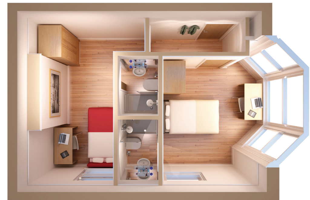
Room 2, 3, 5, 6, 7, 8.